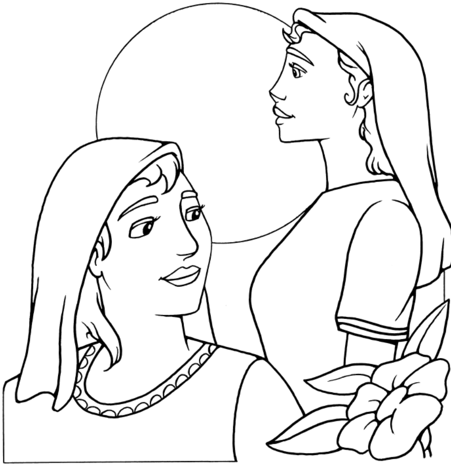
Leah and Rachel

Now Laban had two daughters; the name of the older was Leah, and the name of the younger was Rachel.